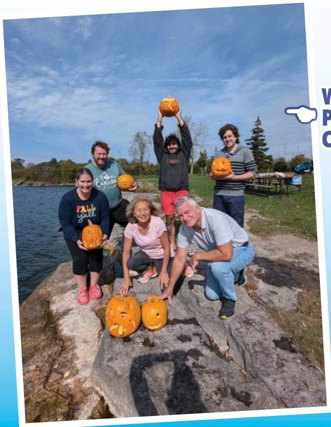
Windmill Pumpkin Carving