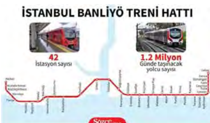
Figure 1 Train system end to end

I am assisting with the construction of the Marmaray line due to my qualifications and experience. My experience and training would result in my designation as a functional safety expert. Rail operations would be my specific focus. It is a broad-spectrum task examining everything from civil works through signalling. For the project I was assigned the task of System Safety Manager. I do not look at the occupational health and safety during construction but examine the Operational and Maintenance safety of the system.