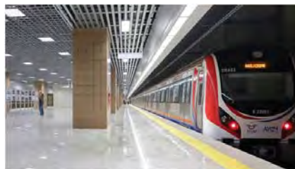
Figure 2 Yenikapi Station with train stopped

Yenikapi is a station that had a very serious delay for the project. The delay was about 5 years and resulted from an archeological find in the construction area. Specifically, the station was built on an ancient and silted in Roman harbour. A whole museum is dedicated to the findings and the station incorporated a display of artifacts and murals representing the findings as well. (Oh very cool! Editor's comment)