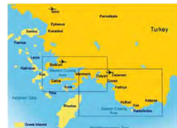
Figure 3 Turkey's Prime Diving Area

Turkey has a very active diving group. One dive outfit is one of the oldest dive clubs in Europe. Diving excursions tend to be on the west coast of Turkey. If you look up diving in Turkey on an internet search you find many advertisements for diving there. All the major operations are along the Mediterranean Sea.